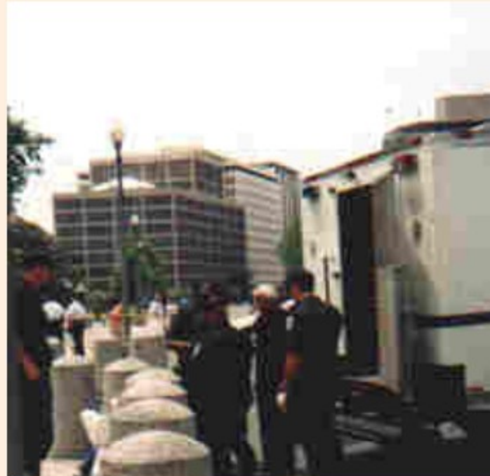
For the June 5th D.C. rally and march vs. the War in Yugoslavia, members of the Washington Action Group made a great float of a bombed out city.