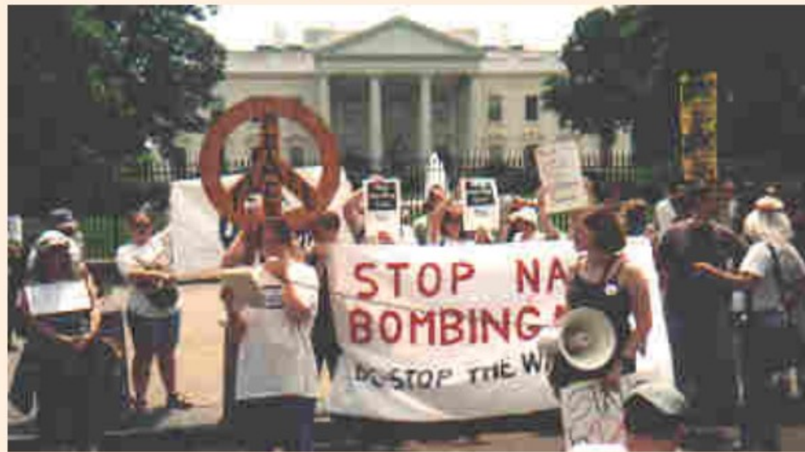
June 3rd two dozen religious and peace activists blocked the gate to the White House, calling for an end to the war. All were arrested. 150 activists sang and chanted in support.